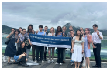
National Museum of Korean Contemporary History