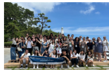
Busan Nuri APEC House