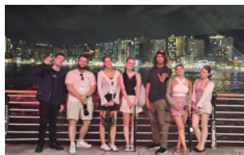
Busan Gwanganri Beach