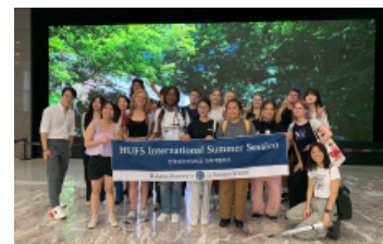
Maeil Broadcasting Network