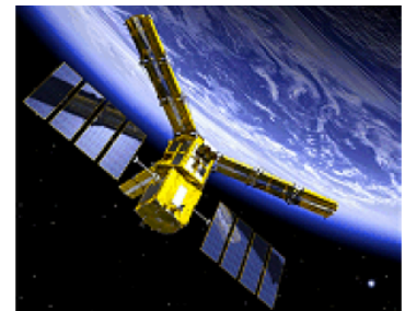
Illustration 1: SMOS satellite

Soil Moisture and Ocean Salinity, or SMOS, is a satellite which provides new insights into Earth's water cycle and climate. It is based on 69 antenna interferometer which delivers averaged correlation matrices. From these Correlation matrices, images of radiation emitted in the microwave L-band (1.4 GHz) are created. The frequency band used for the observations is protected. However a lot of ground based interferers (RFI) can be seen on the received data. The objective of the study is to define algorithms able to detect and localise these RFI.